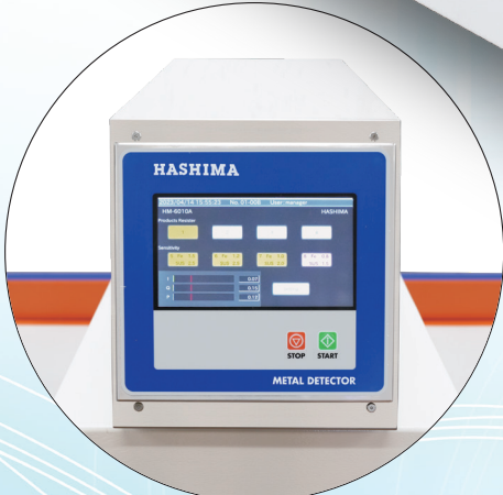
Color LCD Touch Panel